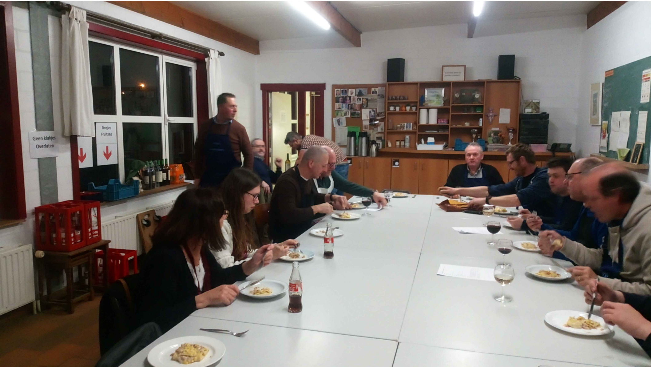
Flensjes met noordzeegarnalen